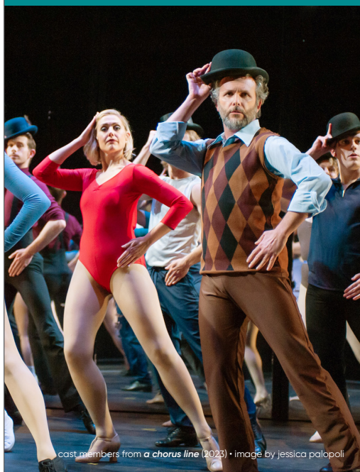
cast members from a chorus line (2023)